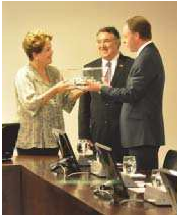
Figure 1. Official communication of the BMW plant to the BFG.