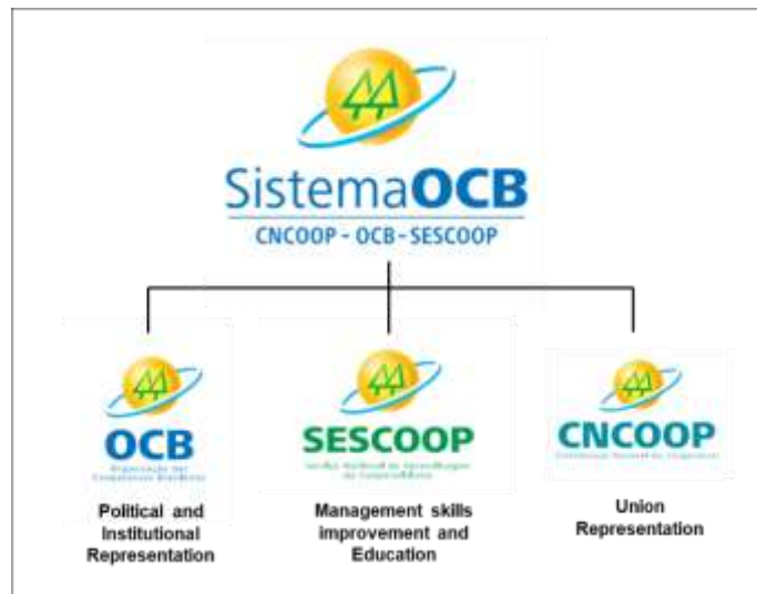
Figure 5 - OCB System.

The distribution of the cooperatives' activities in Brazil are depicted in Figure 6, as follows: