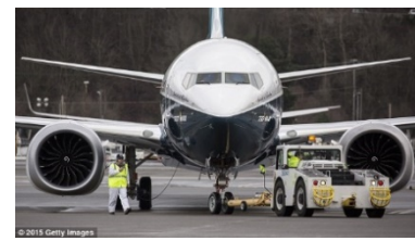
Figure 3: Boeing 737-MAX

Observe in Figure 1, the front view on the early Boeing 737-200. Notice the tiny rounded engines located right below the wing. On the 737-700 (Figure 2), notice the bigger engine intakes with oval shapes. The oval shaped-engine intake is a way to increase ground clearance. The same happened with the 737-MAX (See Figure 3), which, on top of the oval-shaped engine intake, also had to move it up on the wing. In comparison, the original 737 engine size was forty inches in diameter. The new LEAP engines equipping the 737-MAX have a diameter of seventy inches (Travis, 2019).