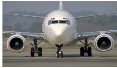
Figure 2: Boeing 737-700