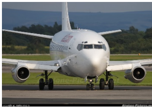
Figure 1: Boeing 737-200