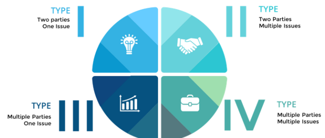
Fig. 1. The Four-Type Negotiation Matrix.

process of communicating back and forth to reach a joint decision." (p. 20). Asynchronous, is negotiation with a time delay between offers, through instant messaging or e-mail . In addition, according to Dias (2020), a negotiation can be categorized into four types: (i) Type I, two-parties, one issue; (ii) Type II, two-parties; multiple issues; (iii) Type III, multiple-parties, one issue – negotiation, and (iv) Type IV, multiple parties, multiple issues - negotiation, as depicted in Fig. 1.