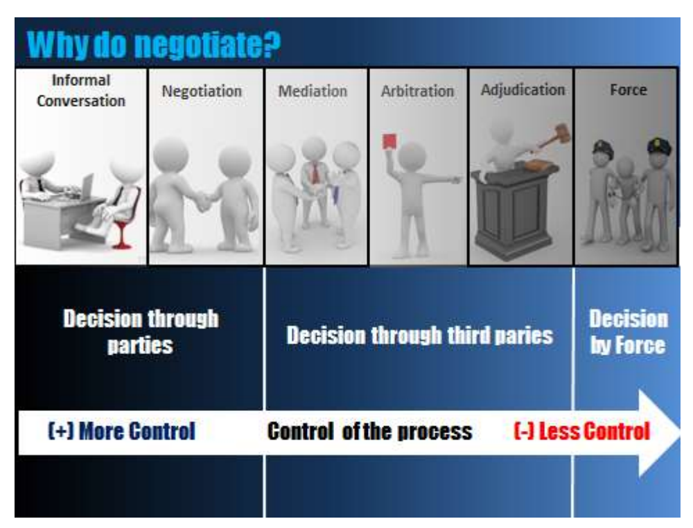
Figure 1: Negotiation Process and Control.

This exercise intends to discuss the role of Mediation in the Negotiation Process. That mediation should be seen not as an intrusion devoted to promote disruption, but one aid to promote consensus between two different parties. One important objective is related to the process control. As seen in figure 1, parties tend to lose control when escalation process arises, when third parties join the Negotiation table, in other words, Negotiation is preferable to any other form of Intervention.