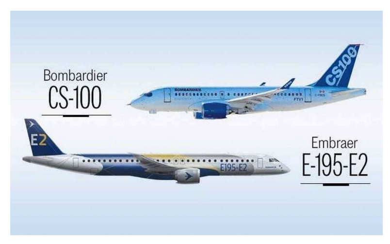
Figure 2. Bombardier CS-100 versus Embraer E-195-E2.

Bombardier C-series has the following features: (a) twin-engine, (b) narrow-body, (c) medium-range jet aircraft, designed to transport between (d) 108-133 passengers, plus (e) five to ten crew members, designed by Bombardier Aerospace (Bombardier, 2018). The CS-100 (C-series jet, Emn=braer E-195-E2 main competitor) is depicted in Figure 2, as follows: