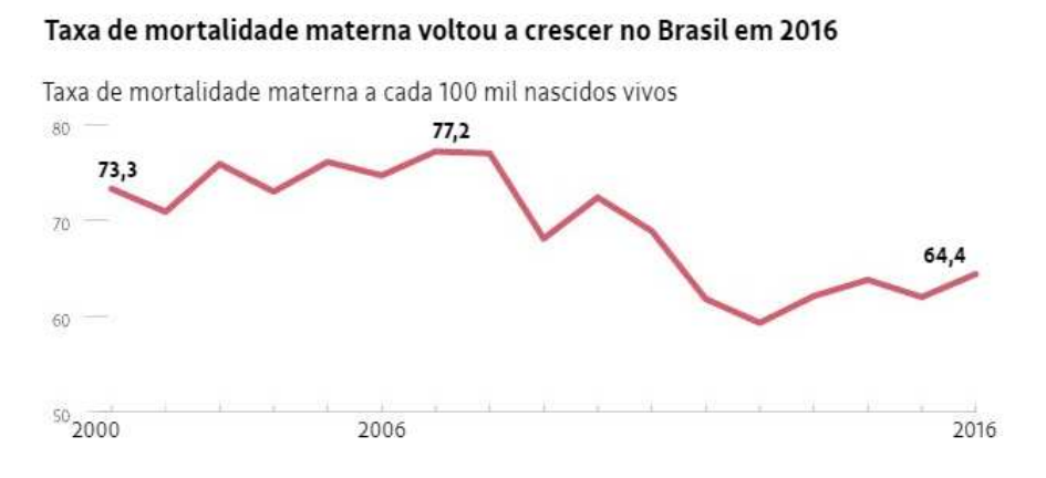
Figure 2. Maternity taxes. Source: Brasil, 2016. Reprinted under permission.

According to the World Health Organization, 287,000 women died of complications during pregnancy, childbirth and the puerperium in 2010 (WHO, 2014). In the face of this global context, for many years, countries have been struggling to reduce maternal mortality. In the year 2000, 191 countries adopted the objective to reduce maternal death. An opportunity that Brazil has agreed to reduce maternal mortality to 35 deaths per 100,000 live births by the year 2015, but the goal has not been reached. The result was 62 deaths per 100,000 live births in 2015, a figure that increased to 64 in 2016 (Brasil, 2016), as depicted in Figure 2, as follows: