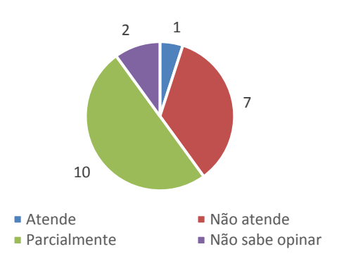
Figure2: preparation for managing NGOs

The first question formulated, was asked to what extent the interviewees considered that the course offers adequate preparation for students who act professionally in the management of NGOs. The results are in the following figure: