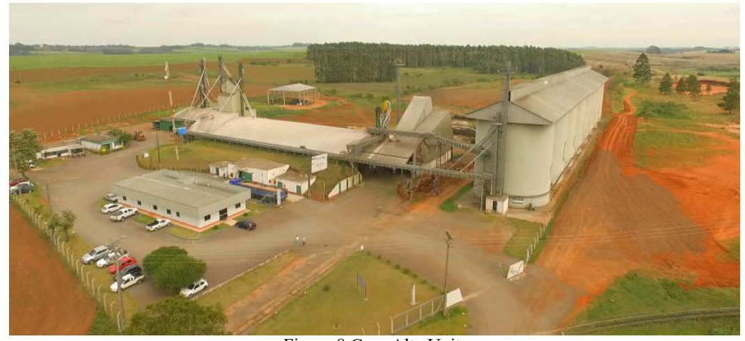
Figure 8 Cruz Alta Unit.