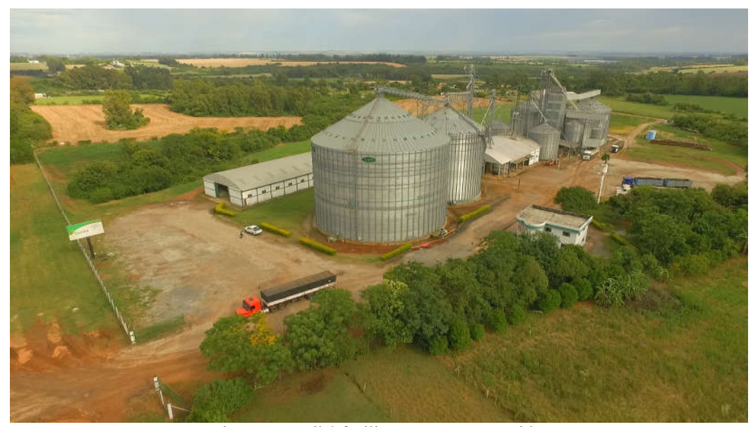
Figure 7 Cotribá facility at Santa Margarida.