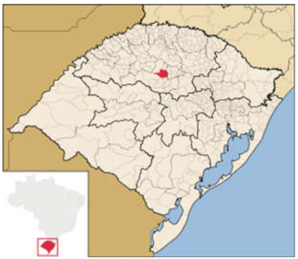
Figure 5 Ibiruba, RS.

Cotribá was founded on January 21, 1911, by 34 associates, with the purpose to create a cooperative following the German model (Dias, 2018), named Genossenschaft<sup>1</sup> General Osório (the municipality of General Osório then changed to Ibirubá). Figure 5 depicts the municipality of Ibiruba, Cotribas' headquarters, located at Rio Grande do Sul state, southern Brazil: