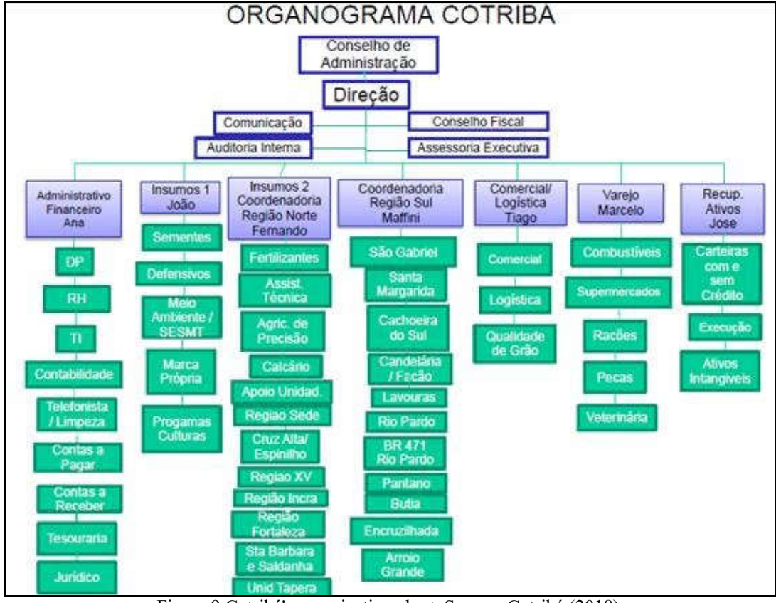
Figure 9 depicts Cotribá's organization chart, as follows: